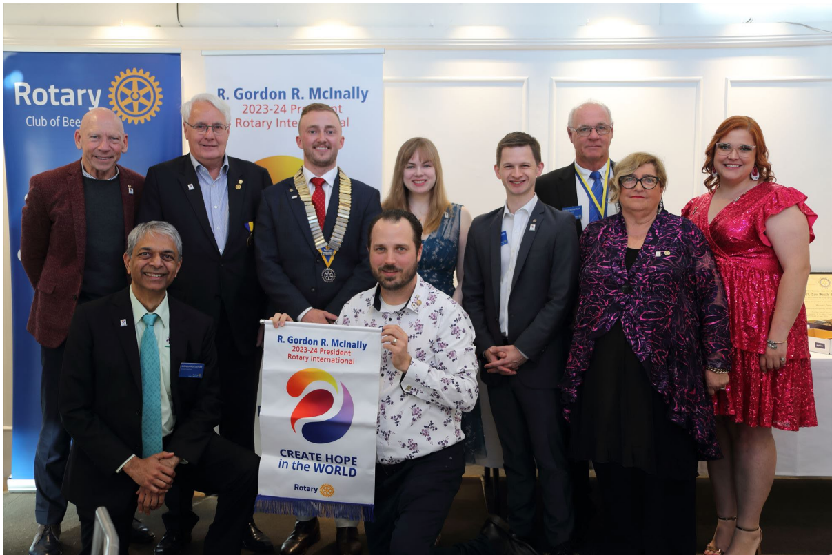
The Board of the Rotary Club of Beecroft 2023-24, from left to right.